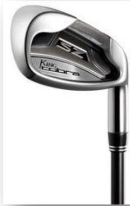
Cavity Back Irons

Cavity back irons are just that, there is a cavity behind the center of the club, rather than the mass associated with the muscleback irons. This design distributes weight around the perimeter of the head, producing a larger sweet spot and therefore greater margin for error. Off-center shots are more forgiving, producing a longer, straighter ball flight than off-center shots hit with a muscleback iron. Cavity back irons are more suited to middle/high handicappers, who are looking for more consistent results from their shots, rather than being able to work the ball.